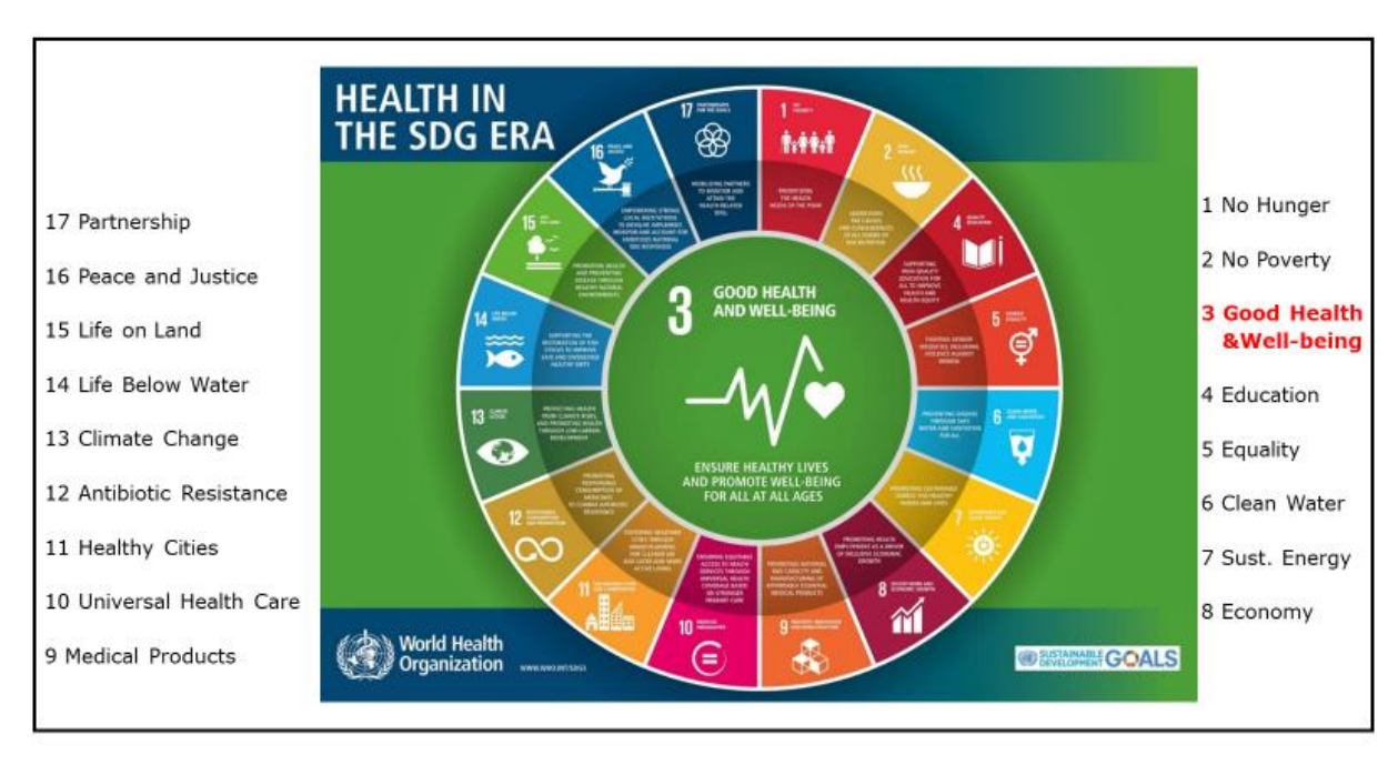
Figure 2: The need for a holistic view on our planet: Health as a unique entry point.

It is encouraging to see important NGOs, private foundations and other key organizations playing an increasingly supportive and coordinated role in achieving the Sustainable Development Goals in tandem with the United Nations and the World Health Organization. We need efforts that are transdisciplinary, science-based, cross-sectoral and concerted. They are vital to set the global health agenda for the years to come. Participants from all over the world bring different views, experiences and priorities. They aren't only welcome – they're the very essence of the World Health Summit vision, mission and philosophy.