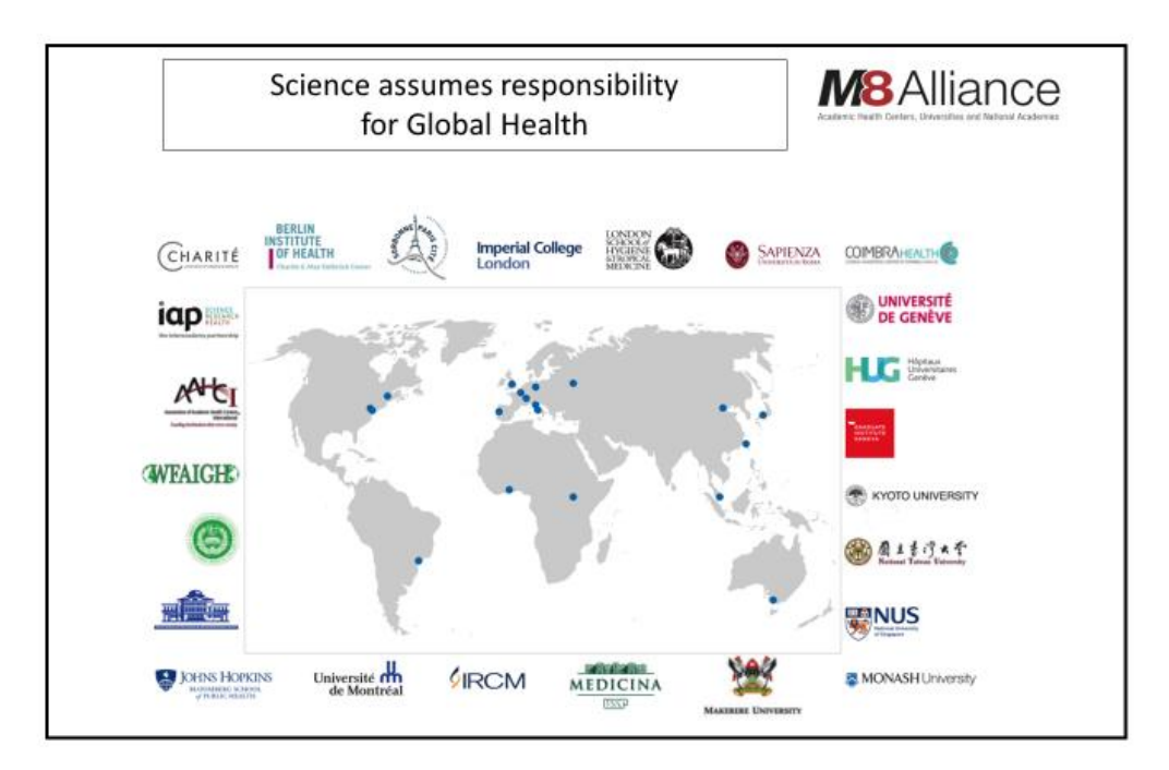
Figure 1: The "M8 Alliance" of 25 academic health centers and universities around the globe.

The "M8 Alliance" of 25 Academic Health Centers and Universities around the globe and the 130 Academies of Medicine and Sciences in the InterAcademy Partnership (IAP) provide a unique think tank for the World Health Summit program in academic freedom (Figure 1). These colleagues provide us with experiences and ideas from around the world. We try to help setting the global health agenda including the G7/G20 Summits and stimulating the building up of global health structures, careers and programs in institutions and nations - and inviting politics, industry and civil society to cooperate in a transparent way.