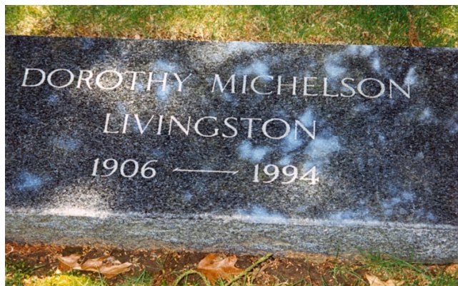
Figure 8: Grave stone of Dorothy Michelson Livingston at Southhampton Cemetery, New York.