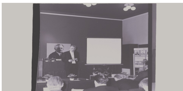
Figure 2: Prof. Dr. h.c. mult. Hans-Juergen Treder (born 4 September 1928 in Berlin; died 18 November 2006), Patron of the Michelson Colloquium at the opening ceremony of the Colloquium.

The Colloquium in Potsdam was officially hosted by the Astrophysikalisches Observatorium Potsdam (Astrophysical Observatory Potsdam, Figure 3) that comprises the Michelson cellar where Albert Abraham Michelson performed the experiment in 1881 for the first time that carries his name today (Figure 5) [9].