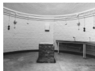
Figure 5: A.A. Michelson performed his experiment in this circular cellar (photo dated 1969) that is in the basement of the dome seen far right in Figure 3 (Haubold and John 1982).

In preparation of the Einstein Centenary, celebrated in Berlin in 1979 and the Michelson Anniversary, celebrated in Potsdam in 1981, young enthusiastic and dedicated staff scientists of the Observatory refurbished the cellular basement where Michelson placed his interferometer equipment (Figure 5) and set up an exhibition of scientific documents and photographs that reflected the situation of physics at the turn of the 19th century after Max Planck's discovery of black body radiation formula and before Alberts Einstein's Annus Mirabilis.