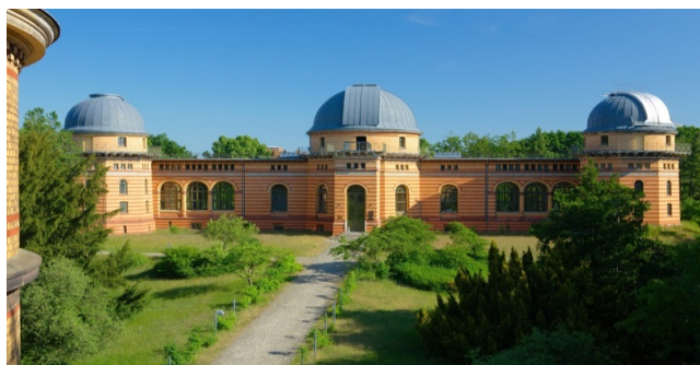
Figure 3: Astrophysical Observatory Potsdam, about 1979.

The Colloquium in Potsdam was officially hosted by the Astrophysikalisches Observatorium Potsdam (Astrophysical Observatory Potsdam, Figure 3) that comprises the Michelson cellar where Albert Abraham Michelson performed the experiment in 1881 for the first time that carries his name today (Figure 5) [9].