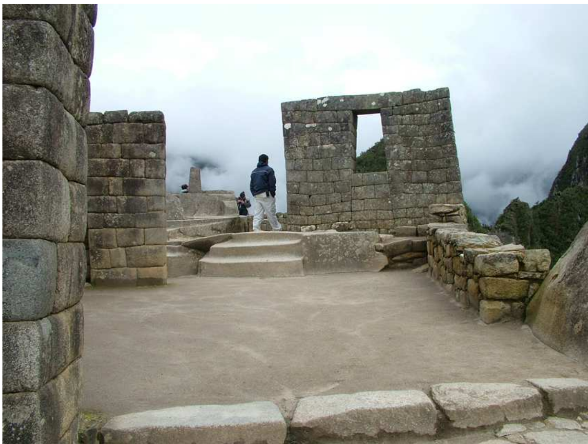
Fig. 3 – View of the Intihuatana stone (background).