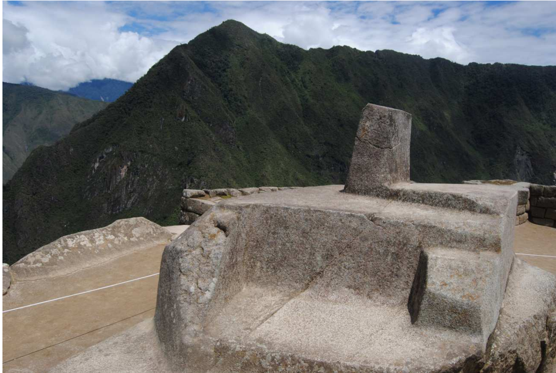
Fig. 5 – The Intihuatana rock on March 9 th 2011, 11:02 am Peruvian time.

to the 75 th western longitude, the sun rock is located at 72°33' western longitude. The difference can be adjusted by means of an astronomical calculating programme, called “Easy Sky“. It tells the exact position of the sun when fed with the coordinates. Further sources of error can be deviations with regard to celestial mechanics between 2011 and the time of the erection of Machu Picchu or deviations of the direction of the stone from the geographical north (in which the sun is culminating). Those error sources, however, can be disregarded, as rough calculations show.